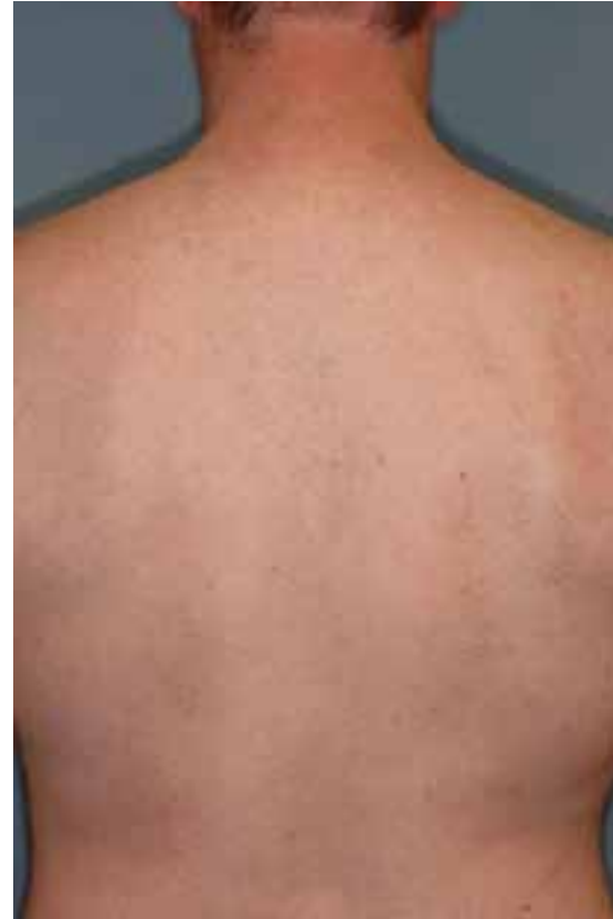
3 Months Post 4 Treatments