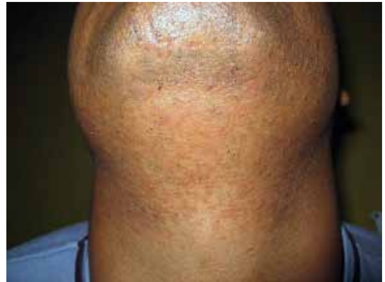
Post Treatment #5

1064 nm, 12 mm, 20 J/cm 2 , DCD: 30–20, 5 Tx