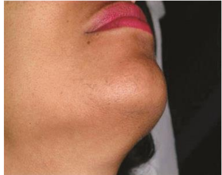
Post 3 Treatments

12 mm, 30 J/cm 2 , 3 ms, DCD: 40–20, 2tx